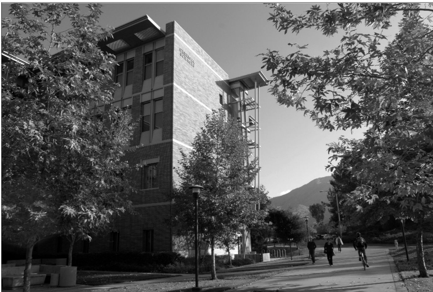
The Chemical Sciences Building is home to the Chemistry Department and some of the best-equipped labs in the nation.

Veterinary Medicine The course work at UCR is designed to prepare students to meet the requirements for admission to California's veterinary programs, the School of Veterinary Medicine at UC Davis, and the Western University of Health Sciences in Pomona. Students should consult the Health Professions Advising Center (visit hpac.ucr.edu ), the UC Davis General Catalog, or the Western University Web site www.westernu.edu/veterinary/home.xml for additional details.