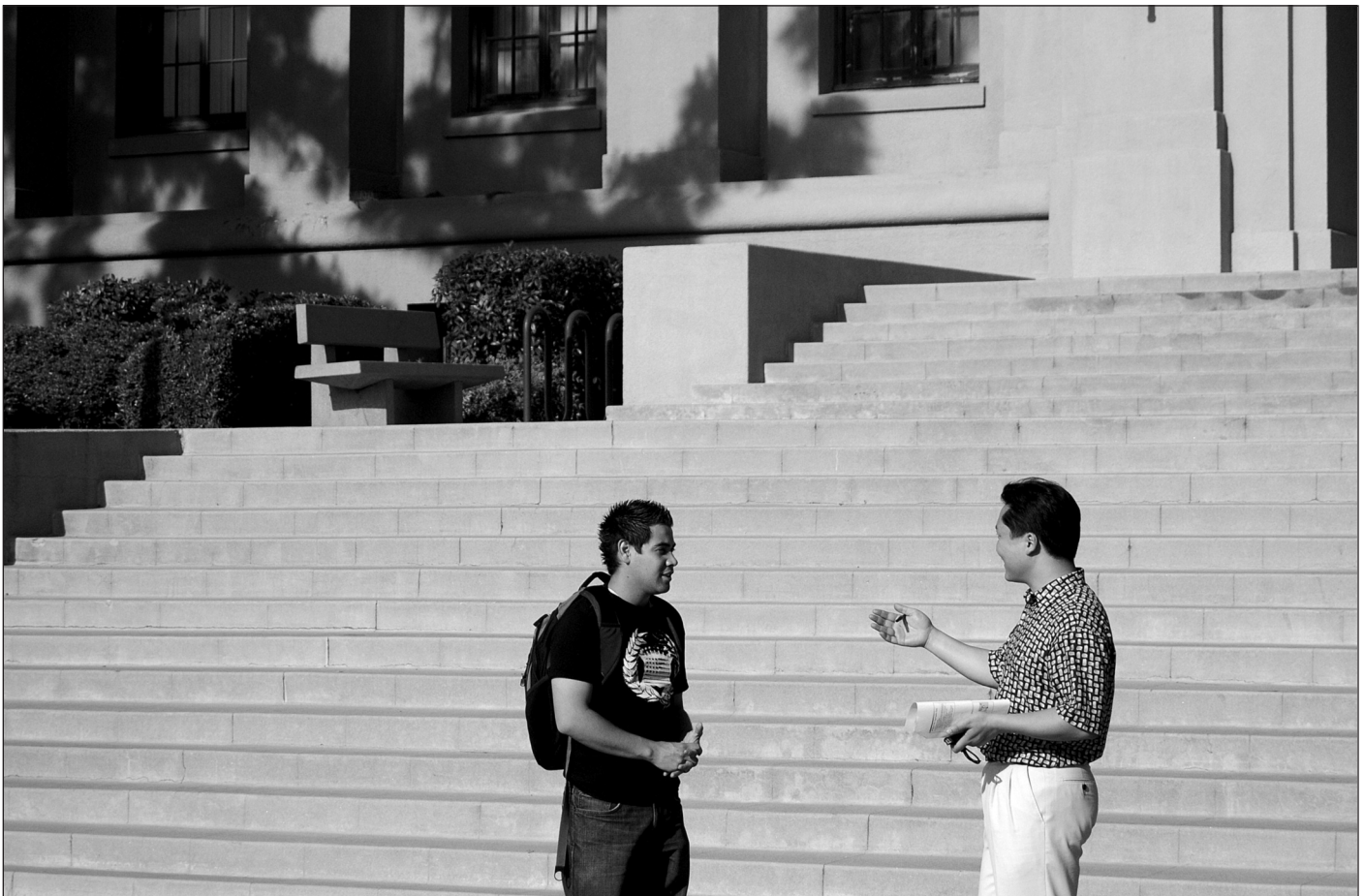
The School of Business Administration provides personal interaction between faculty and students, individual attention, and one of the best equipped business school environments in the country.

In addition to its M.B.A. program, the AGSM offers management training programs for executives, managers, administrators, and other professionals in the private and public sectors. These programs seek to further the professional development of people in management by exposing them to the most recent trends, ideas, and techniques in the field. Many of these programs do not have formal educational prerequisites, since the SoBA is more interested in a candidate's experience record and potential to benefit from the program. These programs are offered as certificate programs, and workshops of shorter duration. Contact SoBA for further information.