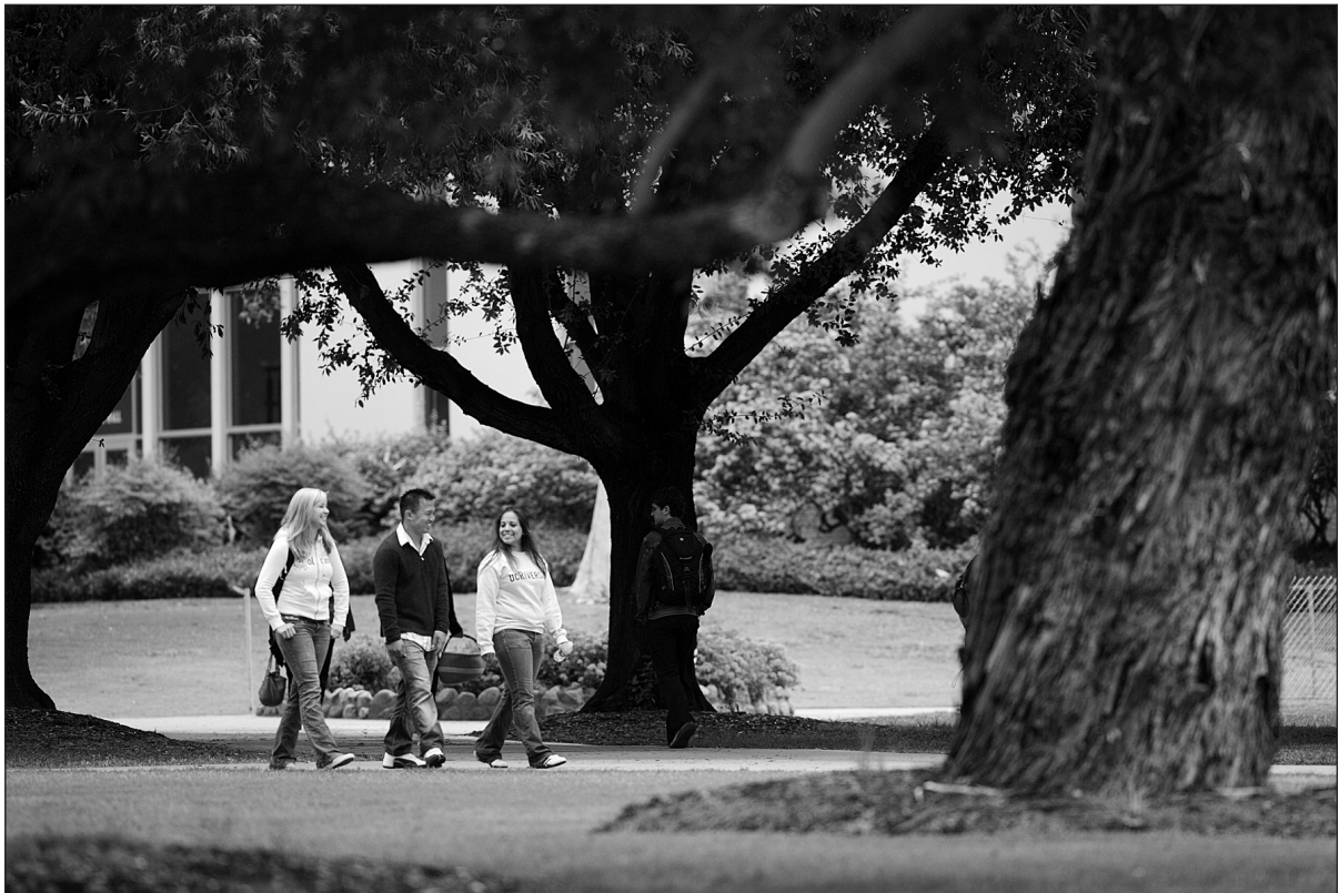
UC Riverside is a large, world class university that has retained its friendly, small college feel.

Privacy Notice All information requested on the Statement of Legal Residence form is required by the authority of Standing Order 110.2 (a)-(d) of the Regents of the University of California for determining whether you are a legal resident for tuition purposes. The residence affairs officer in the Office of the Registrar maintains the requested information. You have the right to inspect university records containing the residence information requested on the form.