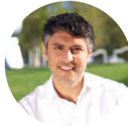
REZA ASLAN Professor of Creative Writing