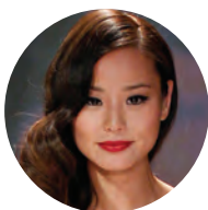
JAMIE CHUNG '05 (Economics)

Performed in The Gifted (2017), Office Christmas Party (2016), It's Already Tomorrow in Hong Kong (2015), Big Hero 6 (2014), Sin City: A Dame to Kill For (2014), The Hangover Part II and III (2011, 2013) and Once Upon A Time (2011)