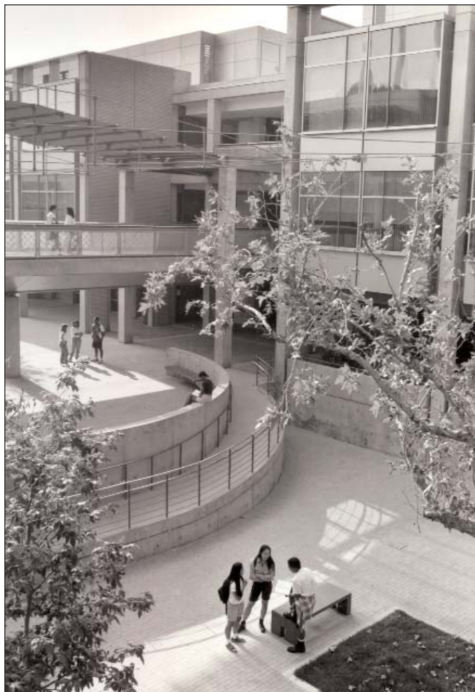
The Marlan and Rosemary Bourns College of Engineering, with five academic departments and a new major, Bioengineering, continues to grow in stature, students, and structures.

Applications for graduation are available in the Office of Student Academic Affairs and must be filed by the deadline established for the quarter in which graduation is intended. The deadline for filing applications for graduation is listed at classes.ucr.edu each quarter. Applications are not accepted after the deadline established for the quarter. If for any reason a student does not meet the requirements for graduation after announcing candidacy, or if a student fails to meet the deadline for filing, an application must be filed for a subsequent quarter.