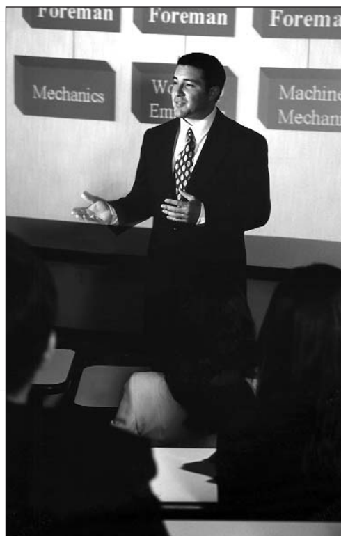
An M.B.A. is offered both on the UCR campus and at the UC Riverside Palm Desert Graduate Center.

Units from another UC campus may be used to satisfy one of the three quarters of the residence requirement and may be counted for up to one-half of the total units required for the UCR master's degree. Department and Graduate Division approval must be obtained before such units can be accepted for credit.