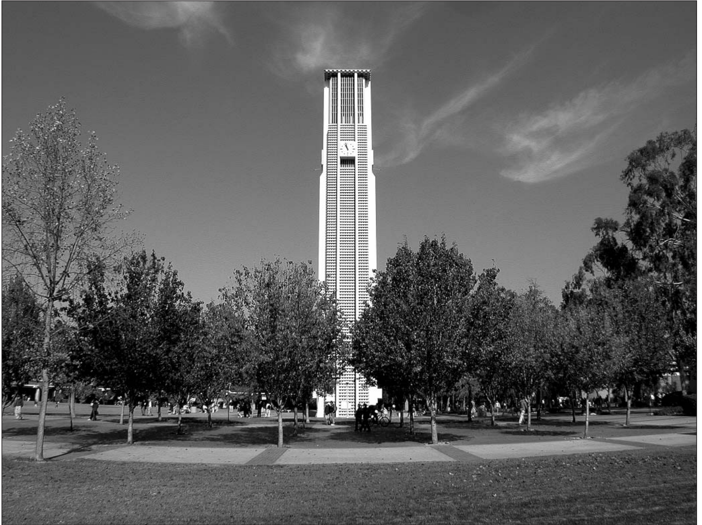
Nestled at the foot of the Box Springs Mountains, UC Riverside's 1,200-acre park-like campus includes the landmark 161-foot Bell Tower, the 40-acre Botanic Gardens, and acres of citrus groves (a resource for UCR research).