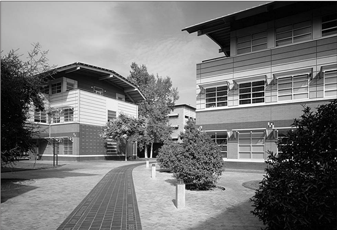
The College of Humanities, Arts, and Social maximizes opportunities for students and faculty to explore, across a broad array of disciplines, what it means to be human.