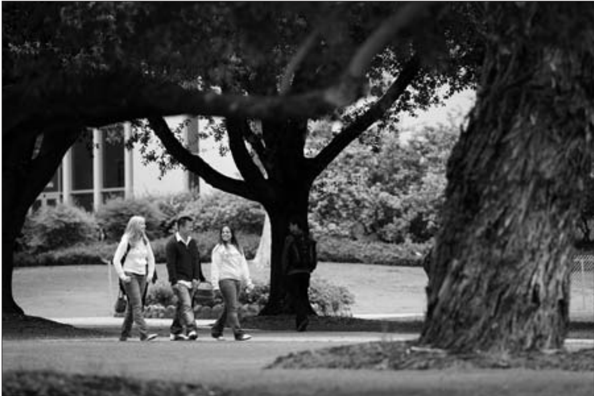
UC Riverside is a large, world class university that has retained its friendly, small college feel.

Privacy Notice All information requested on the Statement of Legal Residence form is required by the authority of Standing Order 110.2 (a)-(d) of the Regents of the University of California for determining whether you are a legal resident for tuition purposes. The residence affairs officer in the Office of the Registrar maintains the requested information. You have the right to inspect university records containing the residence information requested on the form.