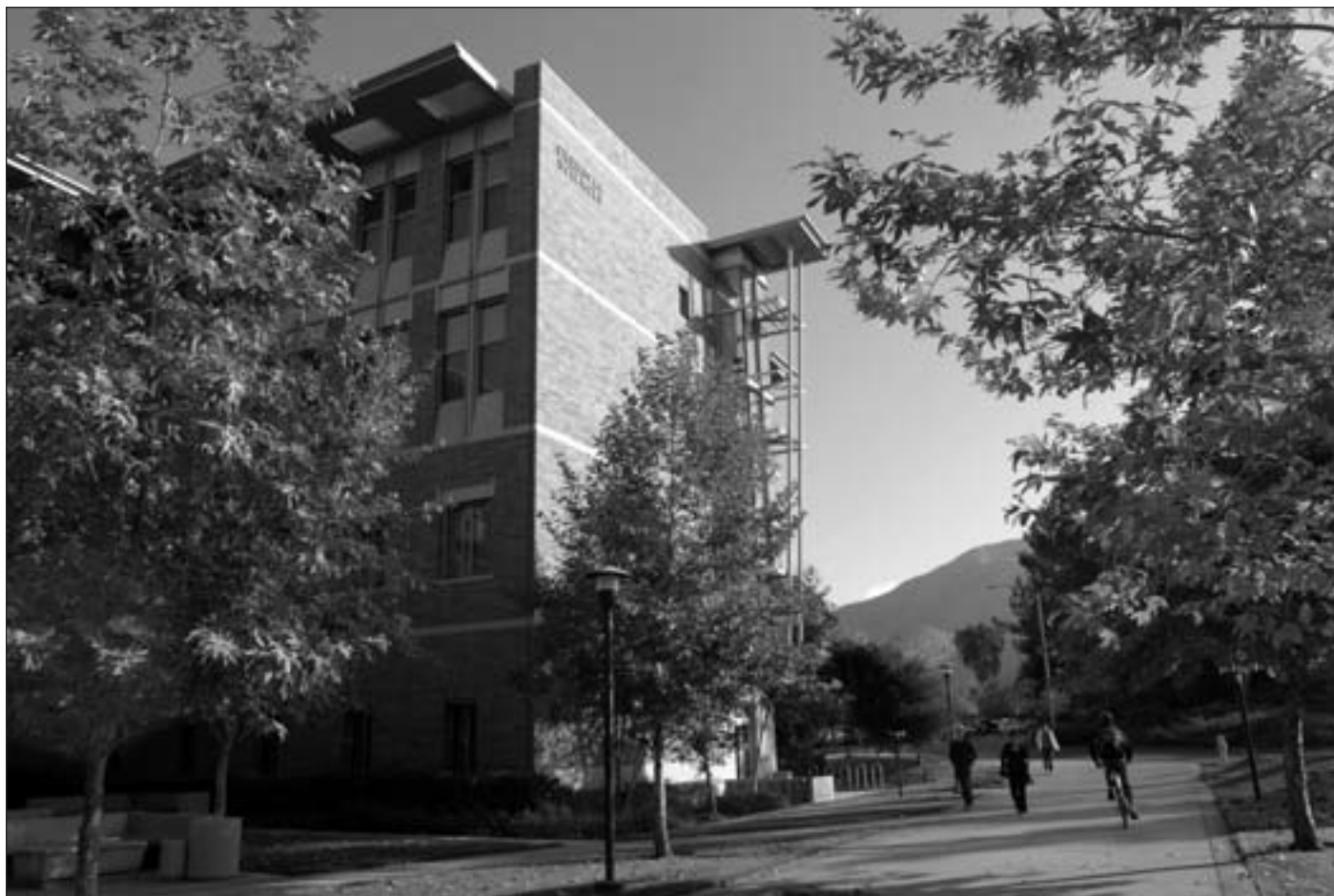
The Chemical Sciences Building is home to the Chemistry Department and some of the best-equipped labs in the nation.